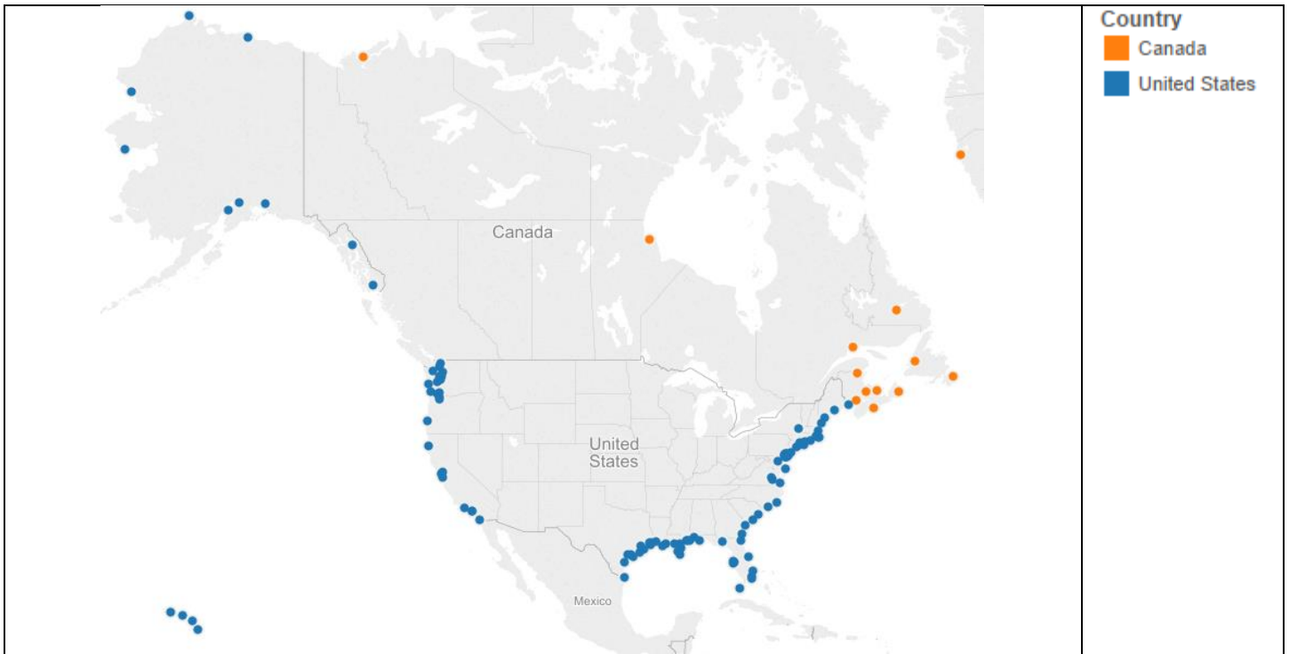
Ocean Ports by Country & State